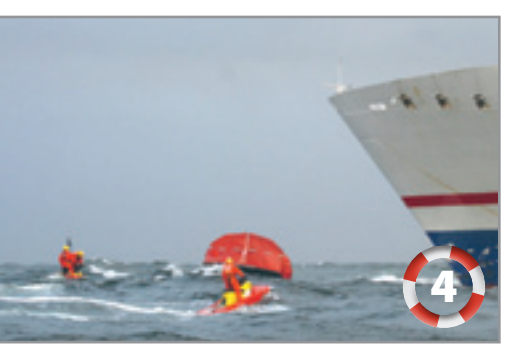
The flexible construction, light weight and drive thru nature of the cradle makes launching less dramatic, even in bad weather.