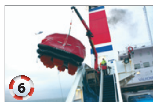
A positive side effect is that empty rafts can be lifted as well, reducing unnecessary use of search and rescue resources.