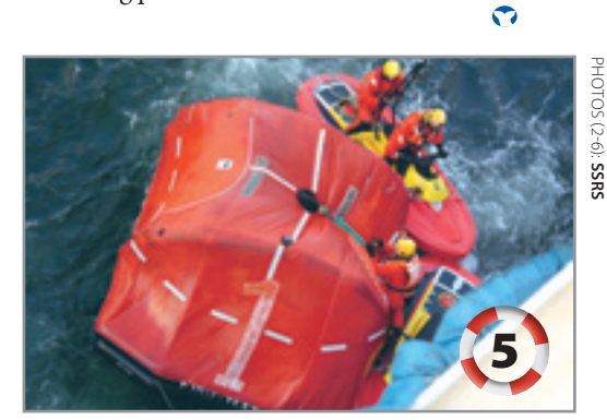
Rafts with survivors are lifted laden and lands on to the deck. In this way up to 40 survivors can be rescued to the safety onboard in every lift. No transfer of survivors is done in the water.